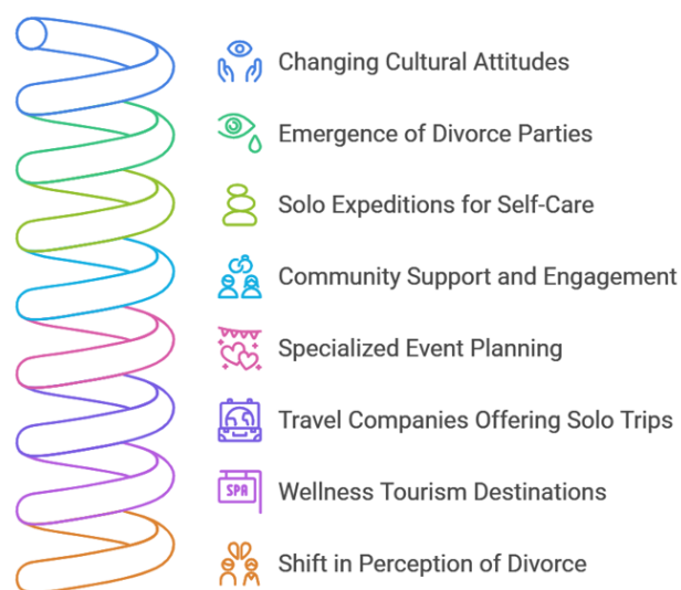
Fig -3: Evolution of Divorce Ceremonies and Trips

The changing cultural attitudes surrounding divorce have birthed inventive new ceremonial traditions centered around empowerment, resilience and self-care. Alongside time-honored rituals like weddings and baby showers, a rising trend now sees divorced individuals embracing the dissolution of past relationships through “divorce parties” - celebratory events offering communal support. Parallely, solo expeditions like liberating trips to regenerate post-split have gained popularity as immersive self-care rituals.