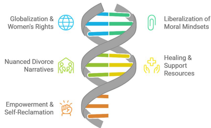
Fig -2: Cultural Shift in Divorce Perception

The cumulative impact of these progressive developments is the recasting divorce as a milestone of self-reclamation rather than defeated acquiescence. Across global metropolis, divorce ceremonies offer avenues for self-care and recalibration similar to weddings. Divorce planners coordinate festivities from hotel buyouts to wild dances to adventure trips that commemorate one's emancipation. Others throw 'divorph' parties mingling sorrowful closure with joyful beginnings. Cake, vow renewals, rituals celebrate divorce initiating next life chapters centered on revived passions, purpose and autonomy.